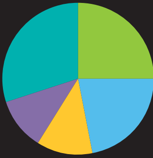
Group revenue by market

Spain 25% North America 22% UK Bus 12% UK Coach 11% UK Rail 30%